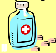
Figure 10: Sample educational script language

Proper disposal of outdated, unwanted medications is the right thing to do! Help protect your health, your family, your community, and the environment by disposing of unwanted medications safely.