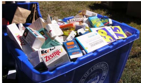
Figure 1: Outer-packaging removed for recycling.

It is possible to save space, and contain costs, by removing unnecessary packaging, specifically pressboard outer-packaging. This is commonly found around blister packaging and around unopened bottles of over-the-counter medications. Because blister packaging keeps the pills separated, it is considered original packaging.