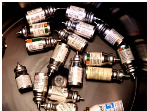
Figure 4: Items under pressure, right.

Items under pressure: Items under pressure are, most typically, inhalers. Use a five-gallon pail because it is very unlikely that you will receive more than this and smaller containers are generally not available. Remove the plastic housing from the inhalers in order to ship less material to the hazardous waste company. If pricing is by weight or volume this can help control costs.