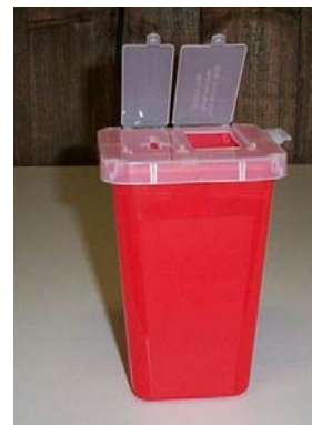
Figure 8: Small sharps container, right.

Whether sharps are invited into the collection or not you must be equipped to handle them. Many companies offer mail-back service for sharps. Be sure to have the collection containers on-site.