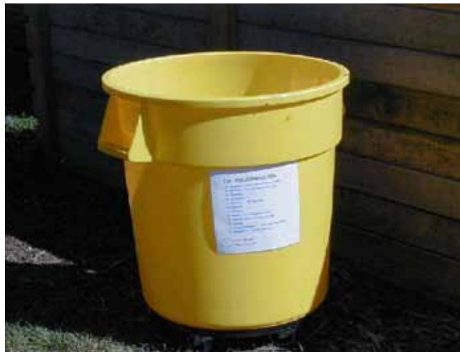
Sample collection container

for feed). The team will need to determine how the materials will get from the school to the compost operation or farm and any costs involved. Is there a hauler that collects organics? Would the farmer be willing to collect the materials? Is there a parent volunteer who would transport the materials?