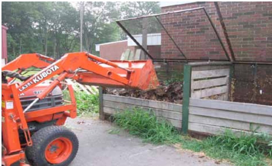
Onsite Composting - Mansfield Middle School, Connecticut